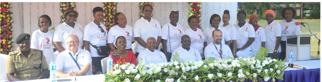
The KSC Women's Day planning committee pose for a group photo with invited guests.